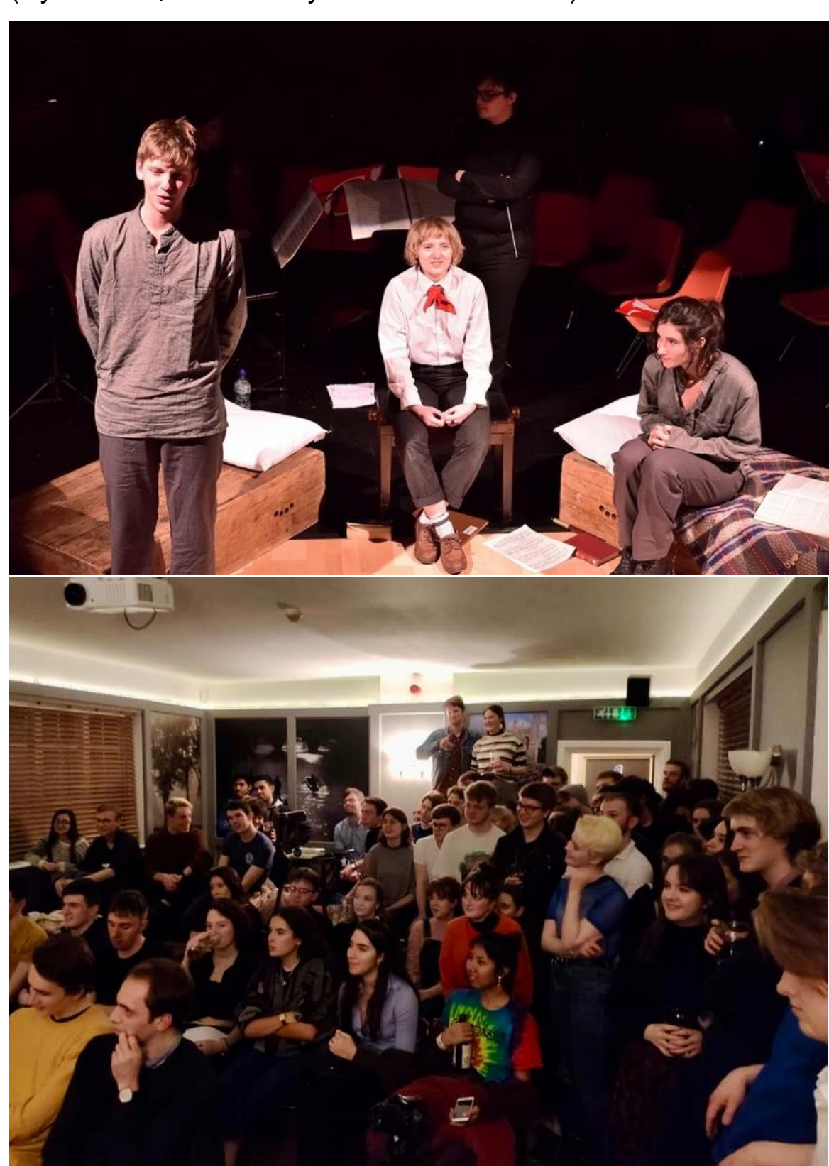
(By Beatrix, a second-year Music student.)